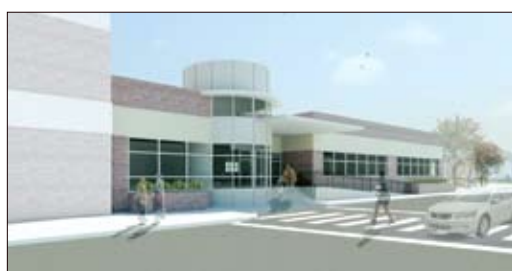
Two school projects on the drawing boards are a gym at Our Lady of Lourdes, Slidell, left, and a new classroom building at St. Peter Claver Central Catholic School, right.